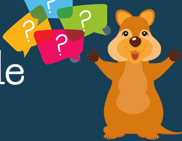
Figure out the pictures and put your answers into the crossword below!